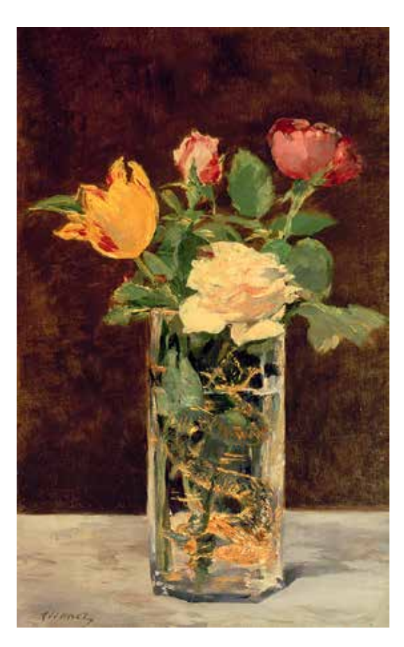
Fig. 84 Édouard Manet, Still Life with Roses and Tulips in a Dragon Vase, 1882. Oil on canvas, 54 × 33 cm (211/4 × 13 in.). Private collection

Manet's signature echoes the decaying plant matter in the glass, a blackened echo of the airy lilacs that gives their freshness an ironic twist. Vase of White Lilacs and Roses (cat. 89) has a similarly remarkable depiction of the decomposing tangle of leaves and stems—painted in tones of brown, orange, yellow ocher, black, and blue, with only a modicum of green—tainting the purity of the water and obscuring the clarity of the vase.