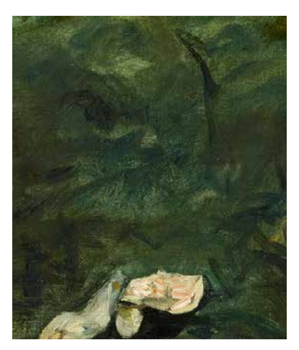
Fig. 78b Detail of Luncheon on the Grass (fig. 78a)

in which one might most expect to find them. In the latter painting (fig. 78a), a single pale pink rose appears near the center point of the bottom of the canvas, below the juxtaposition of the nude's bare foot and her male companion's outstretched leg, as if floating in the marginal space between painting and frame (78b). In Manet's oeuvre flowers appear most often in glass vases, on marble tables, or adorning the clothing or hair of courtesans and fashionable women. They grow in hothouses and city parks, and he sketched them in letters to friends. In Baudelaire's poetry flowers grow out of artists' brains. Manet's solitary rose at the base of Luncheon on the Grass appears to grow out of the painting's frame, an ornament of art—and an elegant accessory of the city dwellers' picnic—as much as an element of nature. Likely adapted from the flowers in the bottom center of Marcantonio Raimondi's engraving of the Judgment of Paris (ca. 1510-20; based on a design by Raphael), one of Manet's most important sources for the painting, the rose is likewise positioned directly below the feet of a female nude. Its symbolic relationship to this scandalously naked woman is Baudelairean through and through, rooted in an aesthetics of irony and an unabashed assertion of beauty's entanglement with sexuality and debased material experience.<sup>19</sup>