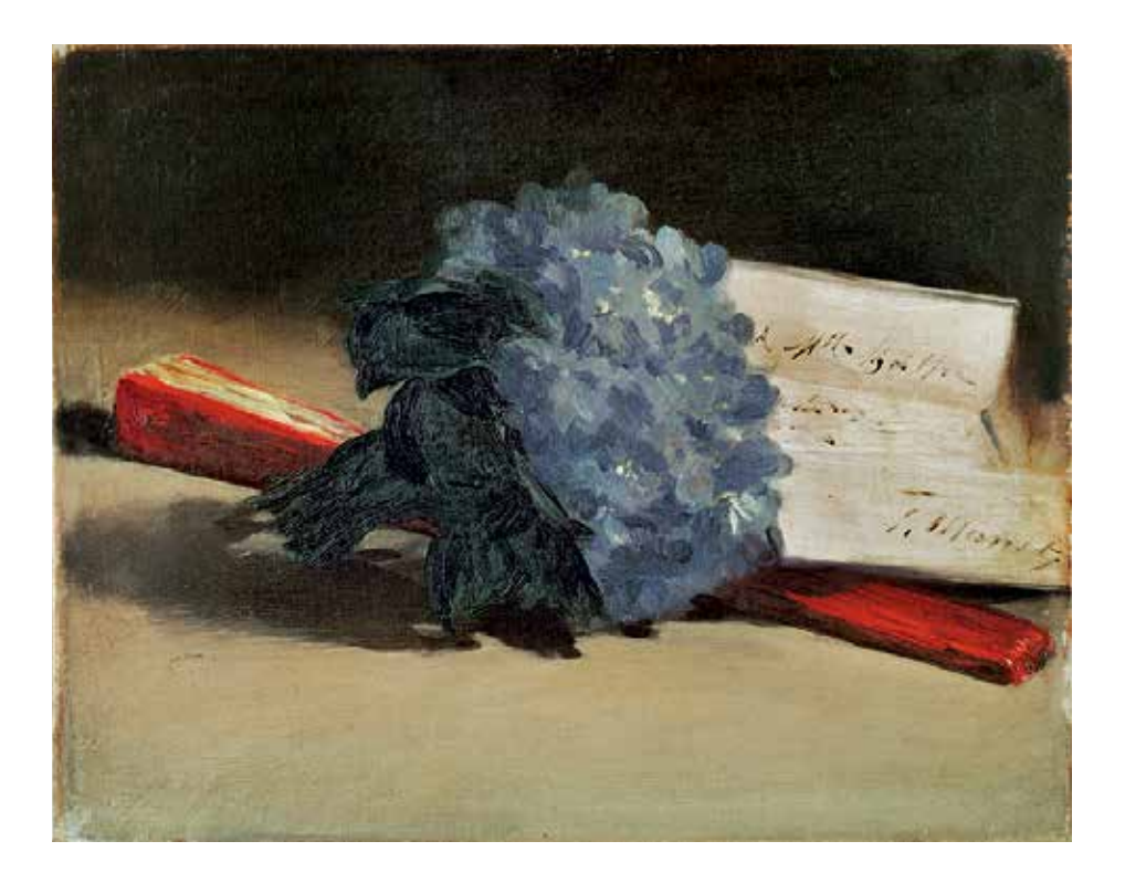
Fig. 82 Édouard Manet, Bouquet of Violets , 1872. Oil on canvas, 22 × 27 cm (8% × 10% in.). Private collection

Like Mallarmé—who wrote verses on stones, Easter eggs, and fans as gifts to friends and loved ones<sup>58</sup>—Manet conceived his still lifes as objects of sociability and